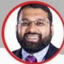
Sh. Dr. Yasir Qadhi