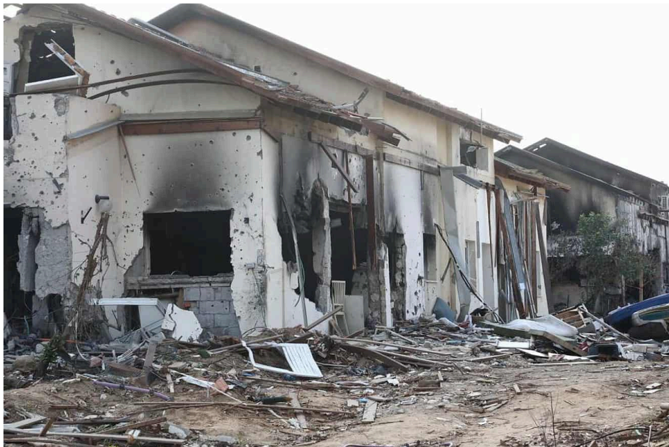
Ruins at Kibbutz Be’eri, Jan. 1, 2024.