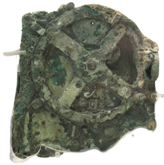
FRAGMENT OF ANTIKYTHERA MECHANISM