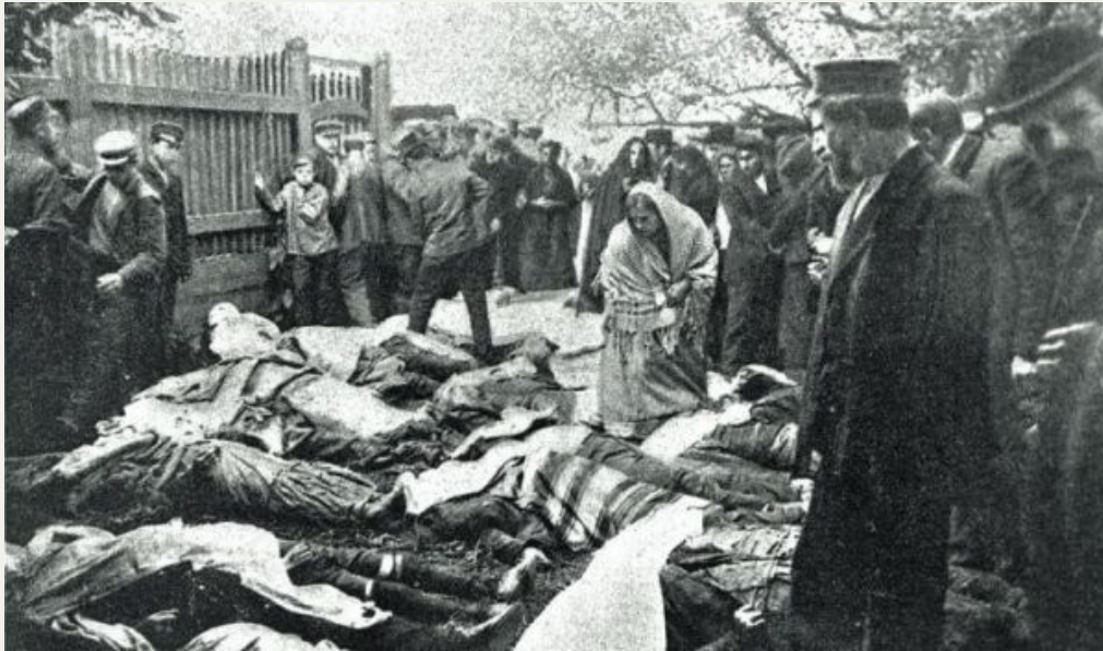
photo on right: Corpses of the Jews killed in the 1904 Bialystok pogrom are laid down outside the Jewish hospital.