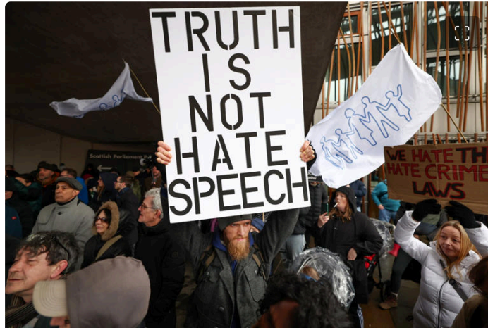
Scotland has seen widespread protests over the laws

'He said, "Well, that falls outwith the parameters . It won't be moving forward as a crime. It will be logged as an incident, but it will not be going further criminally."