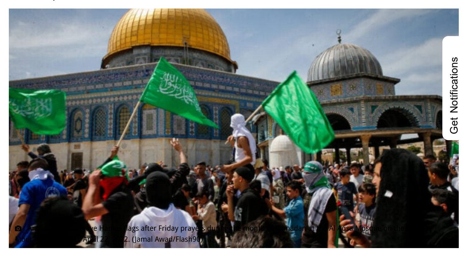
"This is the main goal of Hamas, it is being amplified by Iran and Hezbollah," said Defense Minister Yoav Gallant.