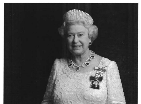
Queen Elizabeth II

“Instead, the ALP is showing its disregard for due process, which is exactly the problem with republican governments, as they are led by